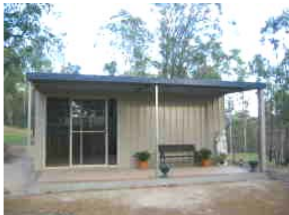
The completed ablution block waiting internal fittings

Tree clearance of dangerous trees took place some weeks ago! Thankfully the weather was pleasant enough for the workers to be in 'uniform'!