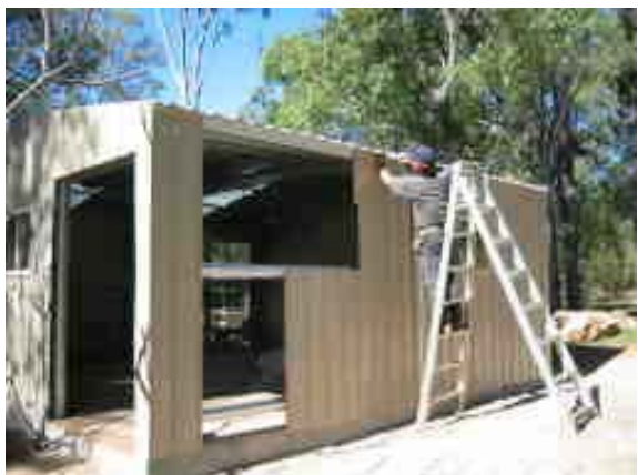
The tradesmen at work on the ablution block.

The Ablution Block to cater to the needs of caravaners, campers and day visitors is well on the way to completion. The Inside has still to be fitted (eg. Showers, toilets and basins) but this shouldn't take too long – although as most parents know things could take longer when relying on ones children. It took long enough waiting for the tradesmen to complete the actual building!